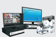
American Dynamics VideoEdge NVRs