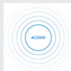
CEM Systems AC2000